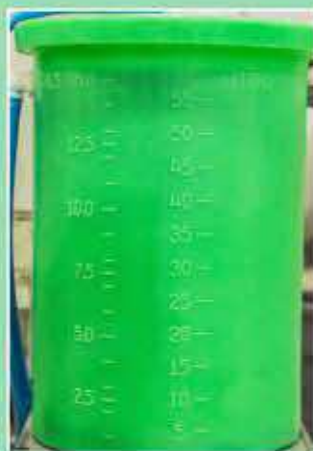
Easy to read graduations on translucent barrel.

Floating Head (6682) and Portable Systems (5040) also available.