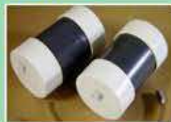
High Temperature Float Kit (6682-XD)