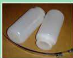
Standard Operation Float Kit (6682)