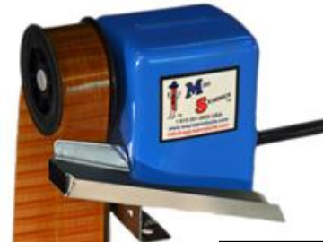
MSB-A & ECB